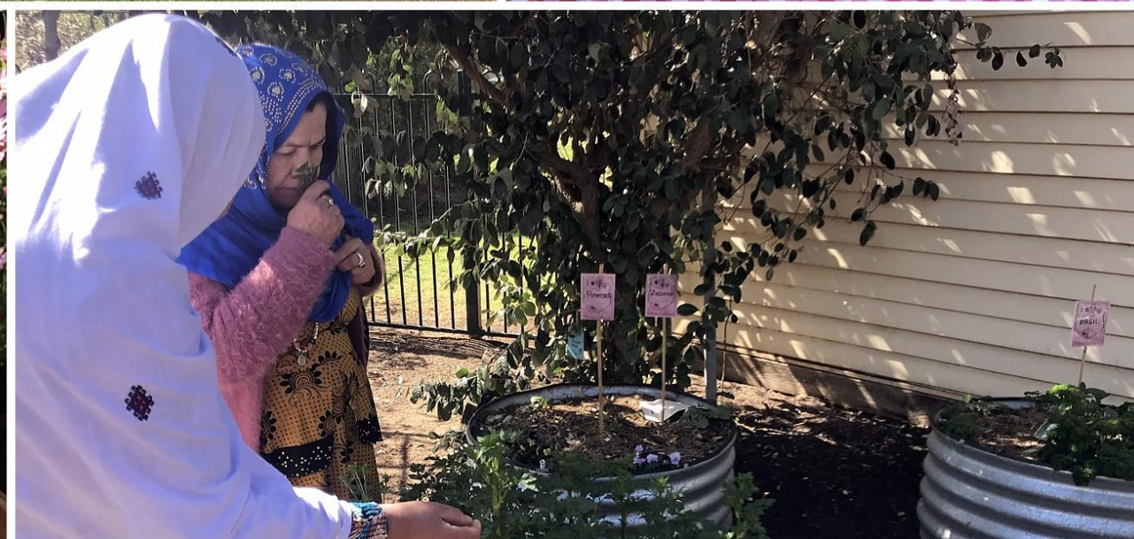
First ever hub session September 9 th , 2018