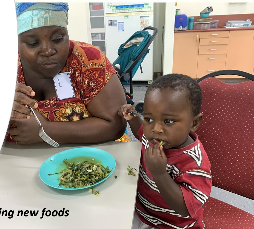
Trying new foods